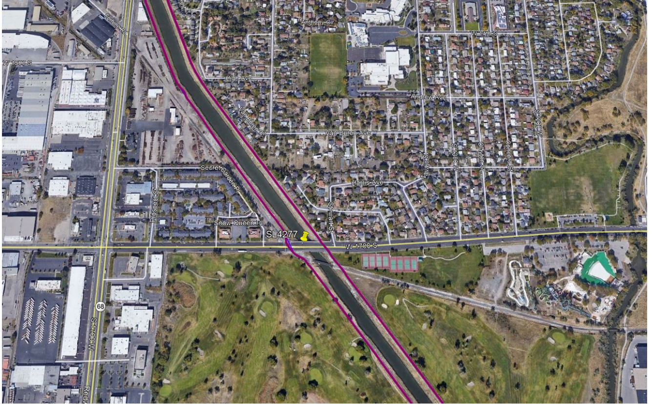
2) Proposed location map